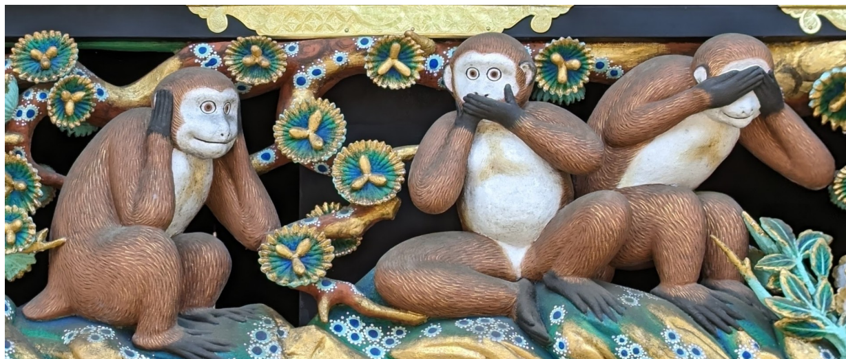
The three wise monkeys at the Tōshō-gū shrine in Nikkō, Japan.

Isa 33:15 He that walketh righteously, and speaketh uprightly; he that despiseth the gain of oppressions, that shaketh his hands from holding of bribes, that stoppeth his ears from hearing of blood, and shutteth his eyes from seeing evil;