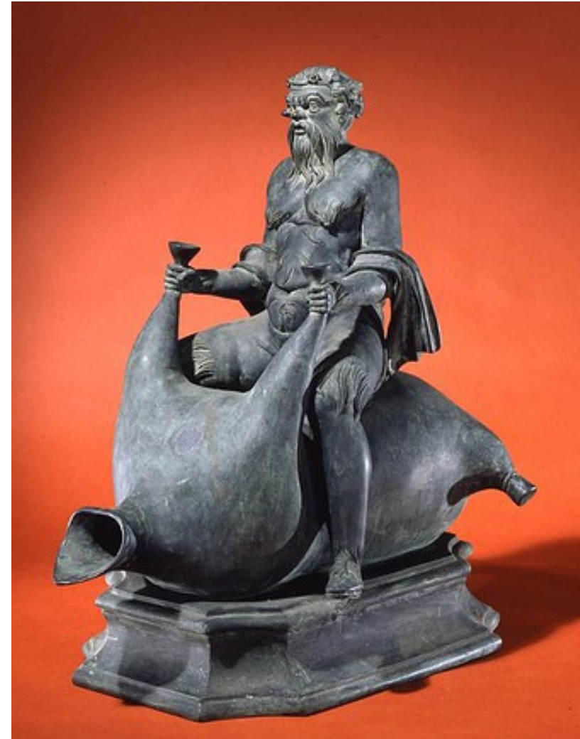
Silenus riding a wineskin, replica of a statue from Pompei (before AD 79) Penn Museum Object #MS3688

http://www.ivanveldhuizen.com/?attachment_id=2475