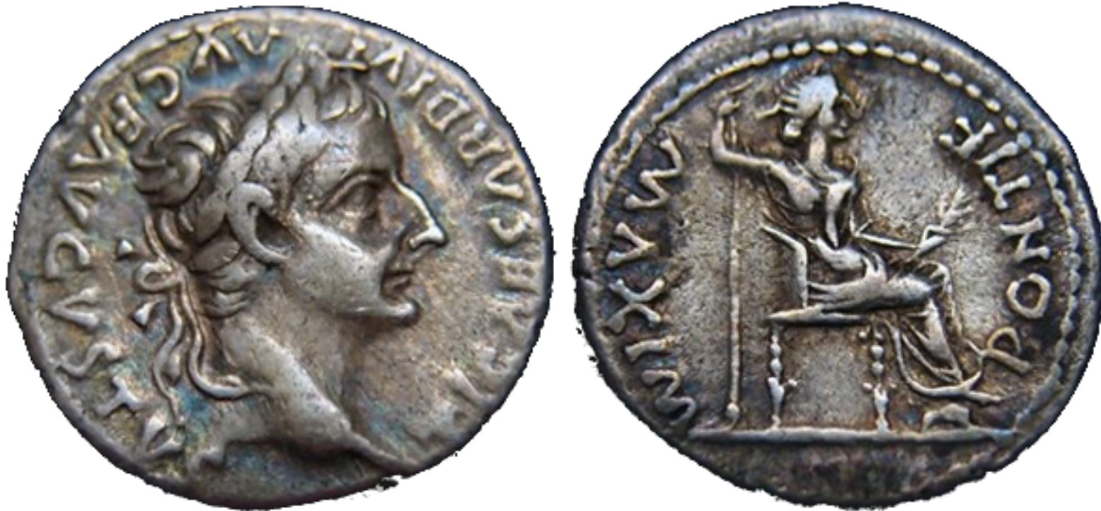
“Tribute penny,” denarius of Tiberius Caesar, ruled AD 14-37.

Mat 22:20 And he saith unto them, Whose is this image and superscription? 21 They say unto him, Caesar's. Then saith he unto them, Render therefore unto Caesar the things which are Caesar's; and unto God the things that are God's.