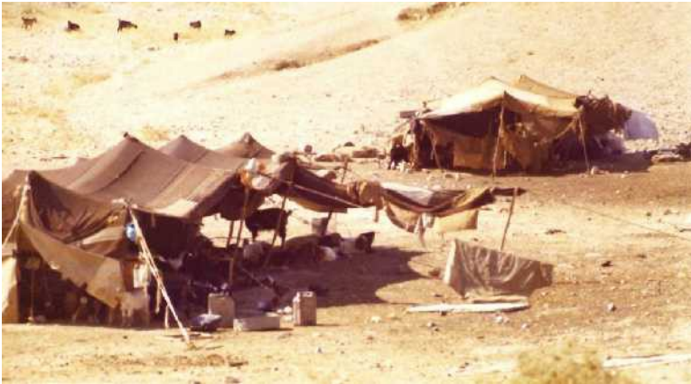
The Patriarchs in the Land, 1800 BC http://www.geolocation.ws/v/P/10243935/bedouin-tents-1974/en

“For Abraham is ignorant of us, and Israel does not acknowledge us”