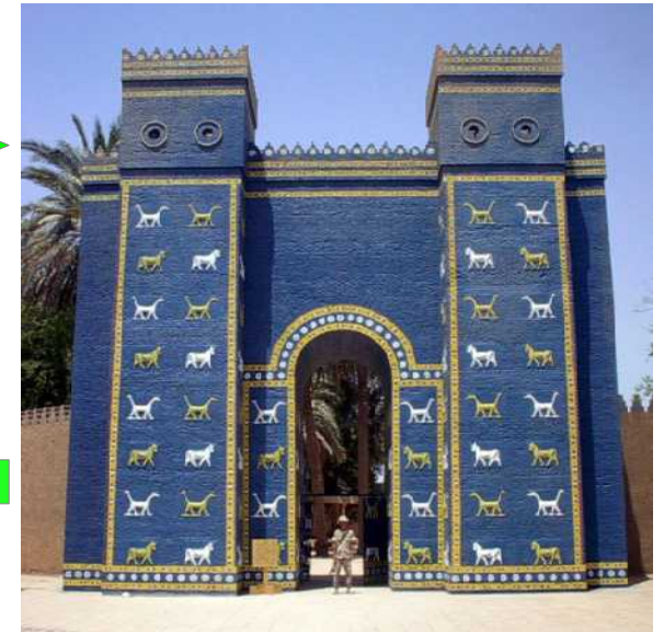
Judah in Babylon, 580 BC

“Look unto Abraham your father, and unto Sarah that bare you” (51:12)